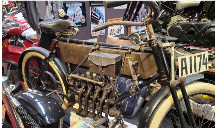
Early model FN from Belgium at Naked Racer