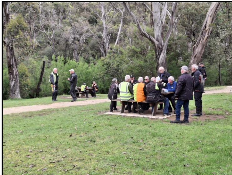
Morning tea at Geehi