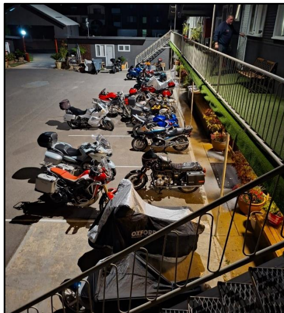
Bikes at Kookaburra Lodge

Continuing our journey over Alpine country via Pine Valley and Wambrook on the Snowy Mountain Highway before turning onto Middlingbank Road. The wind was very strong and gusty and riding conditions were tricky, leaning into the wind. A right turn onto Rocky Plain Road/Eucumbene Road and Kosciuszko Road saw spectacular views of Lake Jindabyne and the Snowy River before finally arriving at the Kookaburra Ski Lodge.