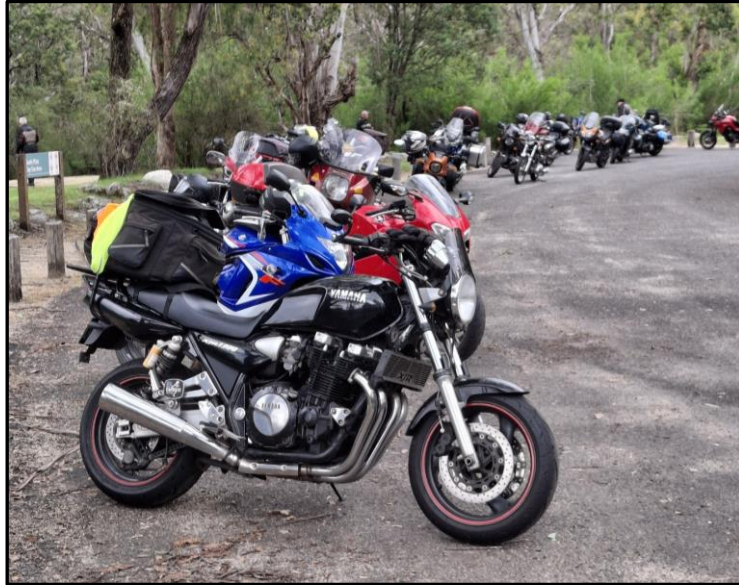
Bikes at Geehi

The morning ride briefing included our hosts at Kookaburra Lodge, Lee and Brenda. The club expressed appreciation for their hospitality during our stay, indicating a future visit is very likely. Lee was quite keen on that idea as he enjoyed having the car park full of interesting motorcycles. Jimmy outlined the itinerary for the day, and we set off along the Alpine Way. First stop was a quick loop through Thredbo. Quite amazing seeing the lodges built on a steep slope but also sobering to recall the tragic landslide that occurred in July 1997. Back out of the village, we continued up the mountain. A sign warning of “winding road next 55 km” gave a clue as to what was ahead. By the time we got to Dead Horse Gap, it was clouding over and getting cooler. Temperature dropped to about 8 degrees, but then slowly rose as we descended the mountain. And so it went, continuous curves, short straights, and very little traffic. The trick of course with these roads is to ride as smoothly as possible. When you do that, it doesn't matter how fast or slow you go, you'll just enjoy it.