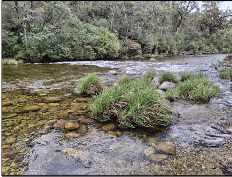
Swamy Plains River - Geehi

Eventually we arrived at our morning tea stop, Geehi. We had been forewarned that this was designated as a self-catering stop, so after bikes were parked, members settled down to unpack their treats. Very peaceful beside the Swamy Plains River. After while we headed off again, just a short distance down the road to Scammells Spur lookout. A little cloudy at the top of the mountains, but still a great view. And of course, being a bike club, a bike did find its way to the viewing platform.