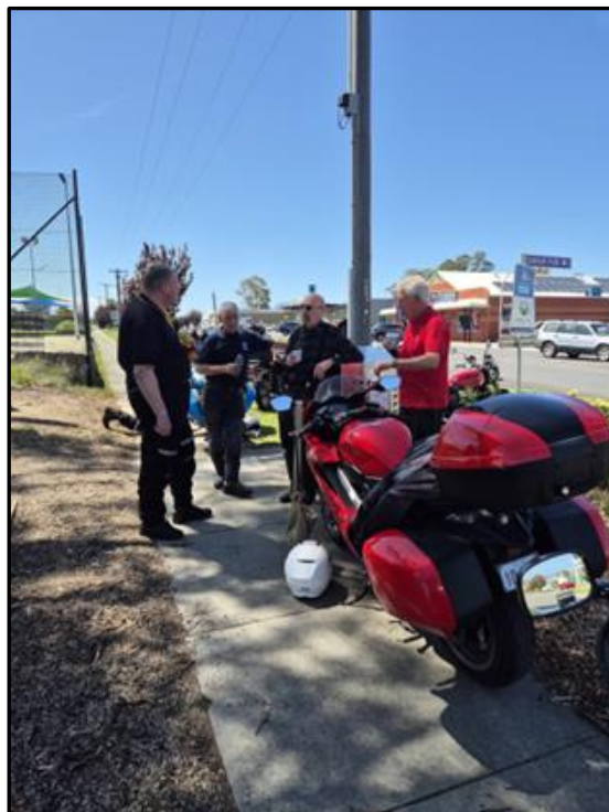
Morning tea at Orbost

Another two kilometres and we were at Orbost for morning tea, refuelling and a rest in the sunshine.