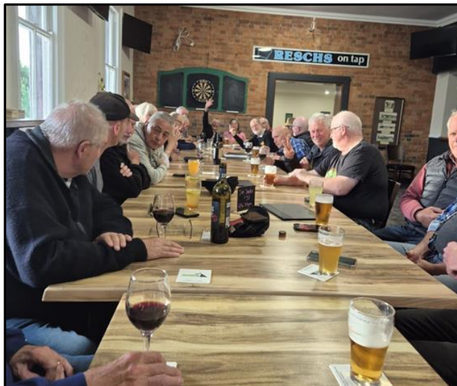
Dinner at the Imperial hotel Bombala

Later we dined at the Imperial Hotel Bombala for a feast of hearty country food and refreshments. My steak big enough to feed a family of four. Another day concludes.