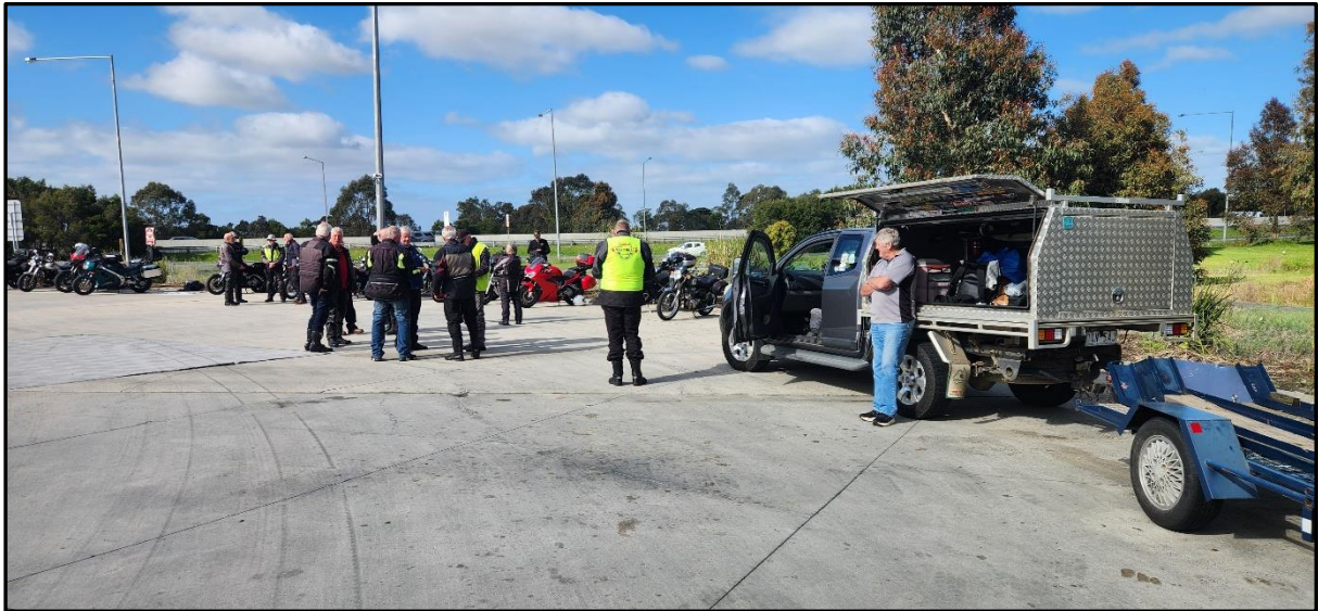
BP Officer Start Point

In finishing, stay upright, enjoy the next 5 days.