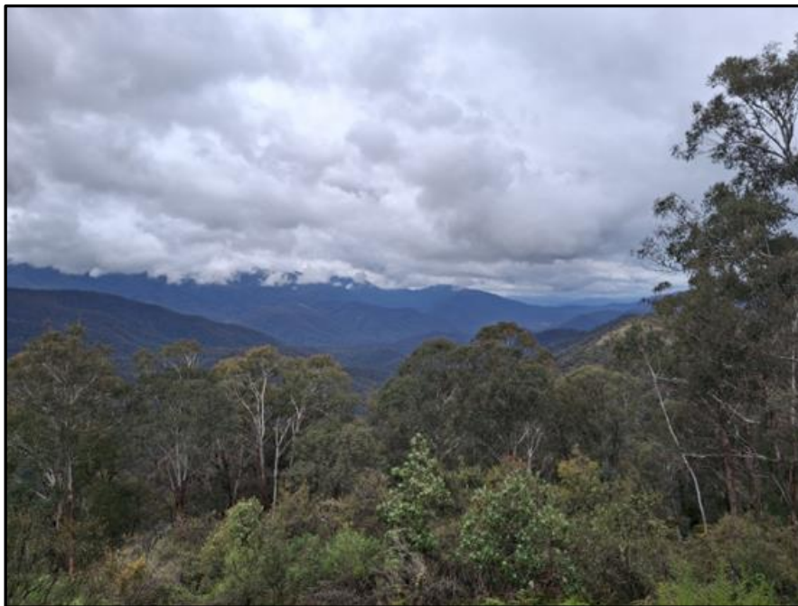
Scammells Ridge Lookout

Eventually we arrived at our morning tea stop, Geehi. We had been forewarned that this was designated as a self-catering stop, so after bikes were parked, members settled down to unpack their treats. Very peaceful beside the Swamy Plains River. After while we headed off again, just a short distance down the road to Scammells Spur lookout. A little cloudy at the top of the mountains, but still a great view. And of course, being a bike club, a bike did find its way to the viewing platform.